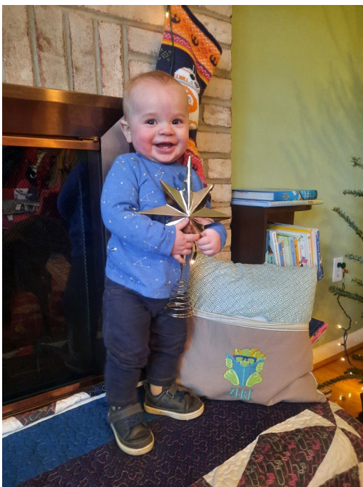
Star of the Season!!