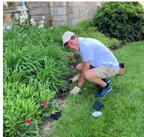
Spring Planting at Calvary