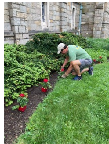
Bents Street Planting Crew