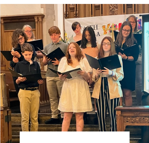
Youth Sunday May 7

Departure from Church parking lot at 10:30 a.m.