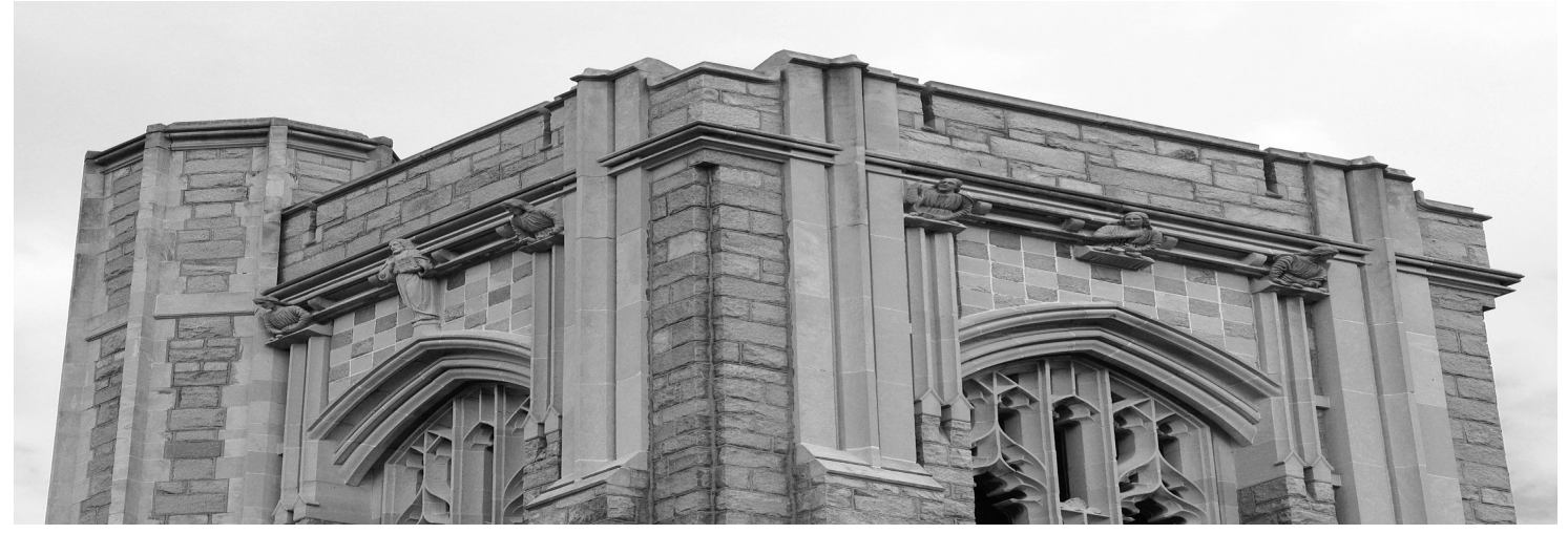
Calvary United Methodist Church