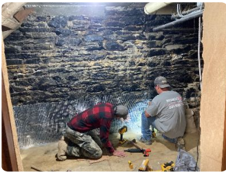
This photo of the blower room in the basement was taken last fall when the renovation work on the room began. The stone walls, bare concrete floor, and opening from the access tunnels that run under the Sanctuary allowed a lot of dirt and dust to enter the blower motor and end up in the pipes as air was forced through.