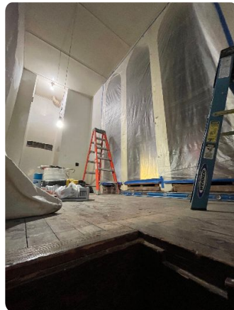
Work is currently taking place in both pipe chambers (the upper rooms on each side of the chancel, behind the arches). The walls and ceilings are being repaired and repainted, the small stained-glass windows are being insulated and sealed, and