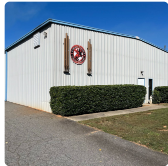
Zimmer's Shop in Denver, North Carolina.