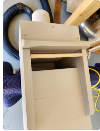
Wood dowels are being added to the Open Wood pipes to improve pipe "speech." Each pipe must play with the correct onset of sound, tone, and volume.

Because our organ will contain 2,791 pipes, Zimmer is making a LOT of pouch boards! Pouches are made of leather and sit under each pipe and the pipe sits on the board. They are part of the process of controlling the wind (air) allowed into each pipe.