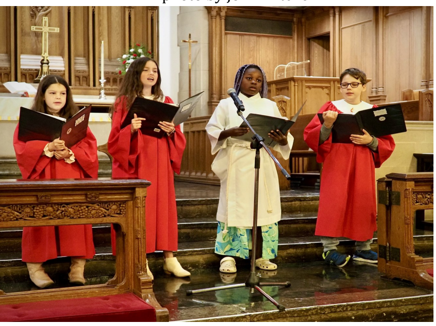
Children's Choir at our May 14 worship service.