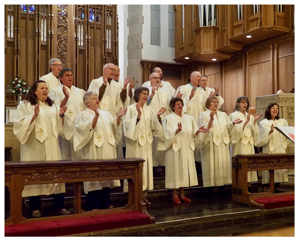
Sanctuary Choir during the May 14 worship.