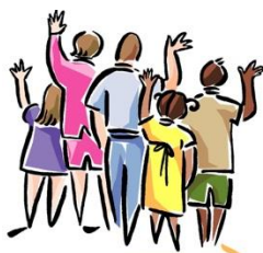
Say Goodbye to Our Pastor and Family