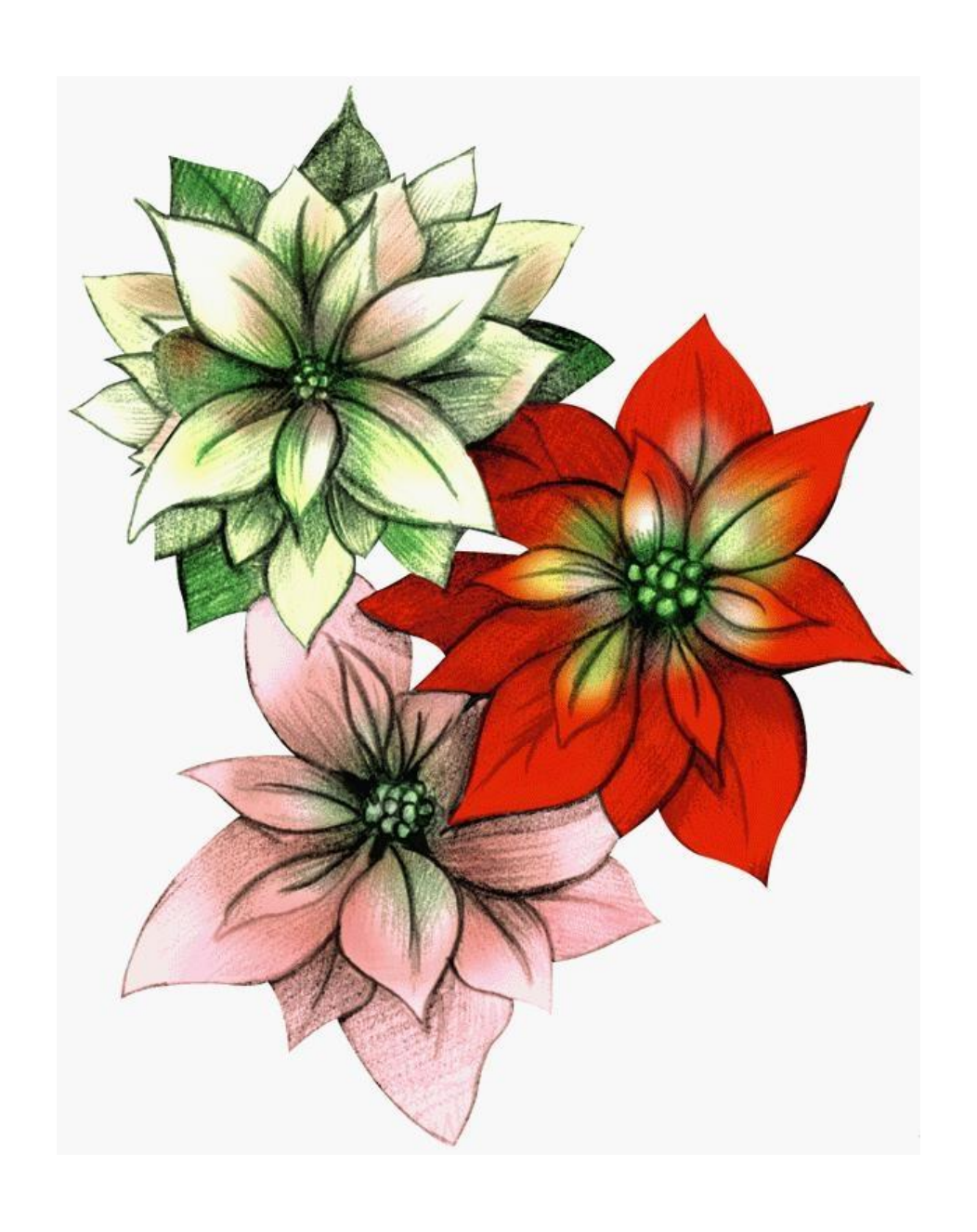
Calvary United Methodist Church December 18, 2022