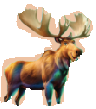
Time With the Children